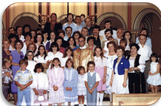
Church choir, 1977