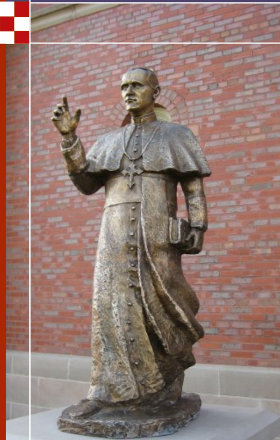
Erected in 2008, a statue of Blessed Stepinac sculpted by Croatian sculptor Vid Vučak.